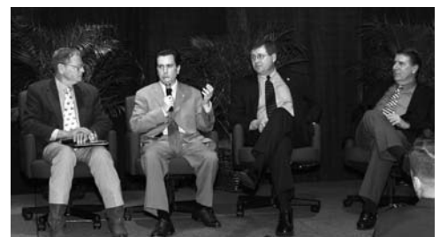
Senator Inhofe and Representatives Boren , Lucas , and Istook