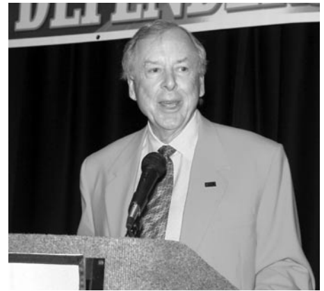
Keynote speaker Boone Pickens