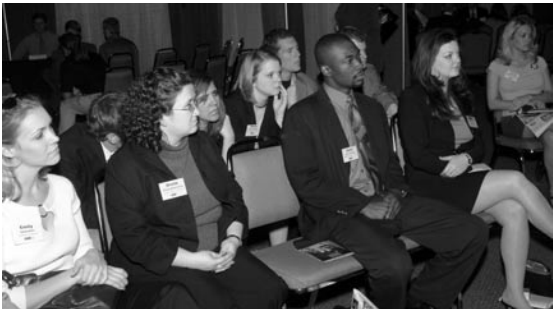
More than 175 Student Day participants were enlightened by radio and TV professionals

If the 2004 OAB Convention did not set a record for attendance, it came awfully close to it. On Friday all sessions were well attended and the foyer adjacent to the meeting rooms and exhibit area were a constant beehive of activity. The big Sony tractor-trailer in front of the hotel also proved to be a popular attraction.