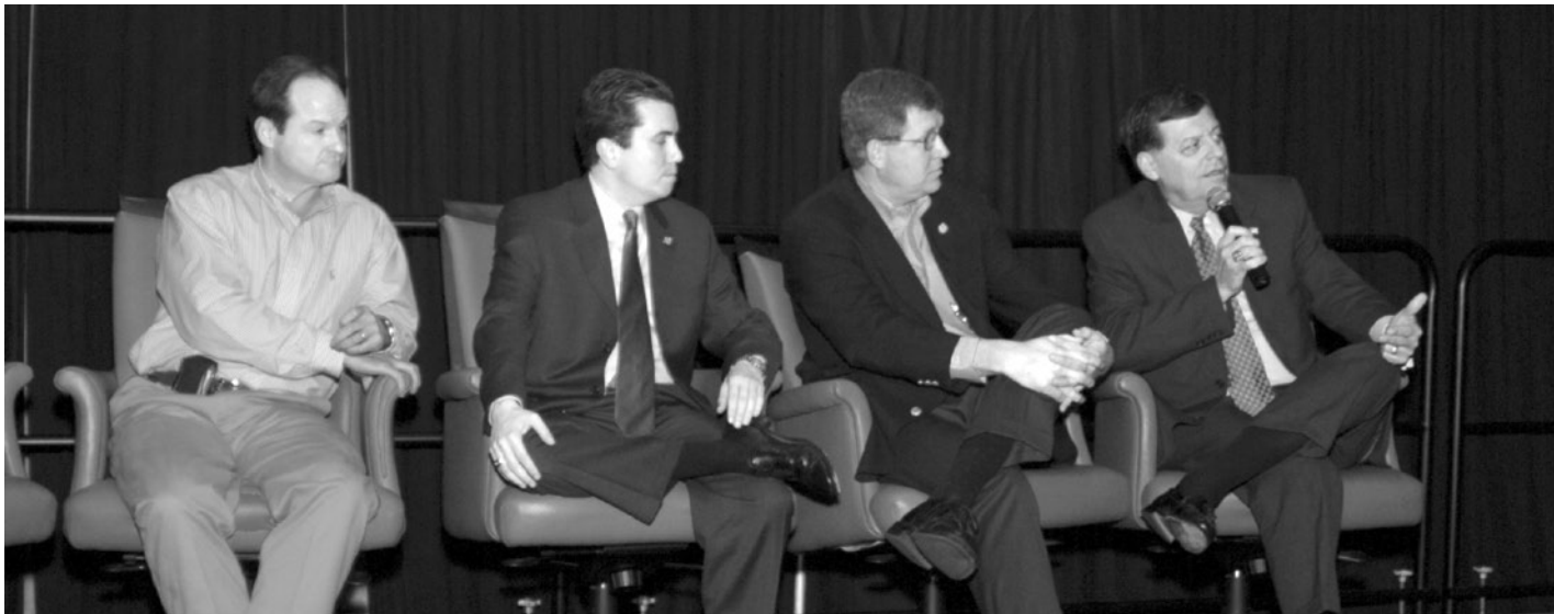
Representatives John Sullivan, Dan Boren, Frank Lucas, and Tom Cole address the issues facing broadcasters.

Two important issues to Oklahoma and the nation's broadcasters are the pending proposal by House Energy & Commerce Committee Chairman Joe Barton for a hard deadline for the return of the analog spectrum, and a recently introduced bill, HR 998, prohibiting satellite radio from providing local programming. Recent meetings with members of the delegation or their staff in Washington indicated the majority of our congressional members were supportive of our position on both issues.